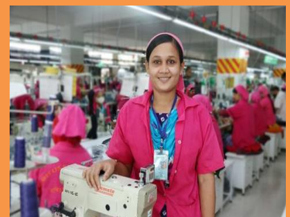
Export Earnings from the RMG Sector (In Billion US$)