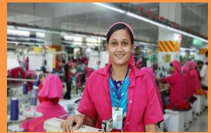
Export Earnings from the RMG Sector (In Billion US$)